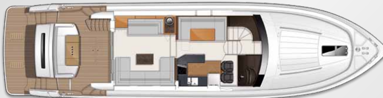
MAIN DECK LAYOUT