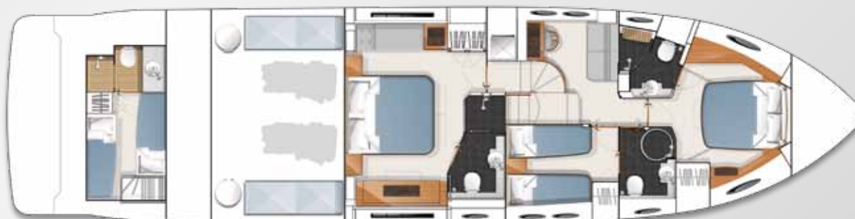
LOWER ACCOMMODATION (OPTIONAL STUDY) LAYOUT